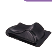
Carbon Fiber Headrest RE-HSF6