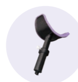
Wrist Support RC-ASF01-A02