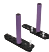
Shoulder Retractor MC-YG001-A03