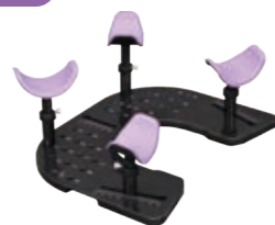
Overhead Arm Support RC-ASF01