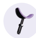
Arm Support RC-ASF01-A01