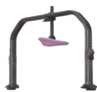
Belly Bridge MC-YF001-A01