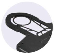
Pins for fixing headrests