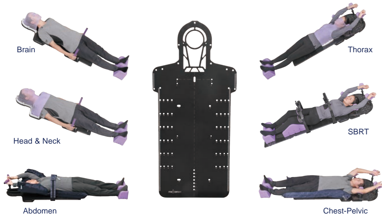
Y-Series AIO Baseplate Solutions

The Meicen Y-Series Baseplate have a Pin-lock design for easy operation, provide the highest degree of stability for brain, head and neck, thorax, pelvic and full-body support. Dual-configured for adult and pediatric treatments. It is compatible with all S-type Masks and Meicen Pin-lock type Masks.