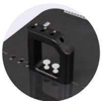
Optional locations for Leg Separator MC-CG001-A04