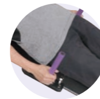
Easily adjustable Hand Grips