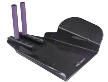
Wing Board U-Grip