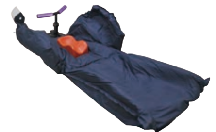
T-Shaped Vacuum Cushion RC-E3010F