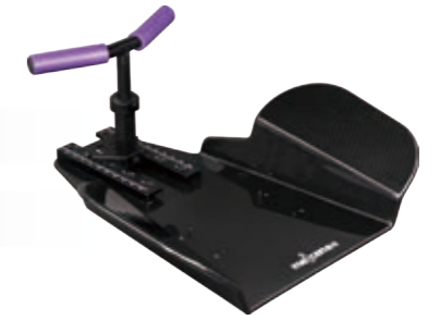
Wing Board T-Grip